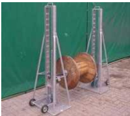
Fig.: Hydr. lifting jacks and steel shaft with sliding bearings and fixing clamps

Drum dia Carrying capacity per pair 900 – 3.200 mm 10 t 900 – 3.200 mm 20 t