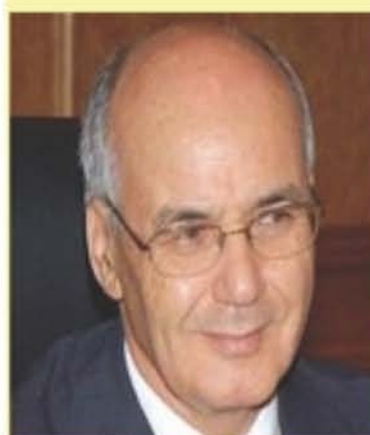
Youcef Yousfi Minister of Energy & Mining Algeria