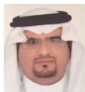
Ahmed Fageeh Deputy Minister of Petroleum & Mineral Resources KSA