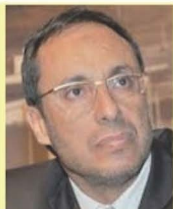
Abdelkader Amara Minister of Energy, Mines, Water & Environment Morocco