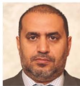
Matar Hamed Al Neyadi Deputy Minister of Energy UAE