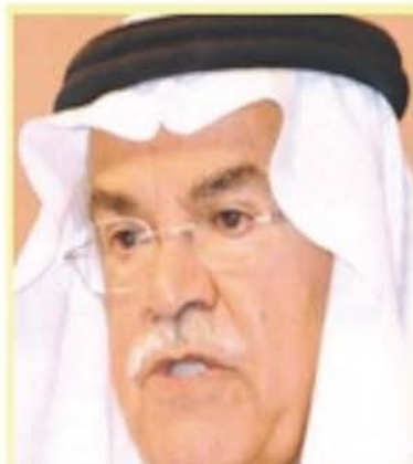
Ali bin Ibrahim Al Naimi Minister of Petroleum & Mineral Resources KSA