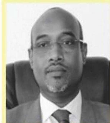
Ali Yacoub Mahmoud Minister of Energy, in charge of Natural Resources Djibouti