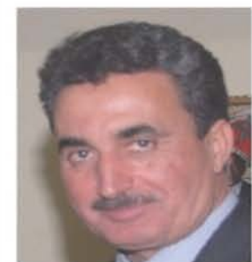
El Hadi Gashut Director General Regional Center for Remote Sensing of North African States