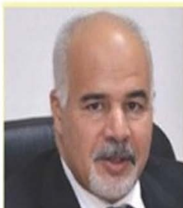
Suleiman Ali Al-Taif Al-Fituri Minister of Industry Libya