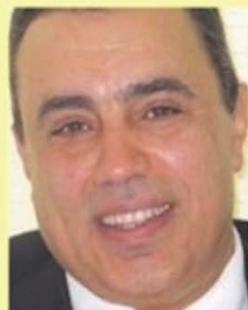
Mehdi Jomaa Minister of Industry Tunisia