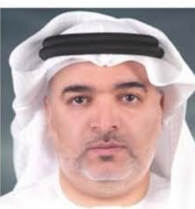
Khalid Al hosani Ministry of Energy UAE