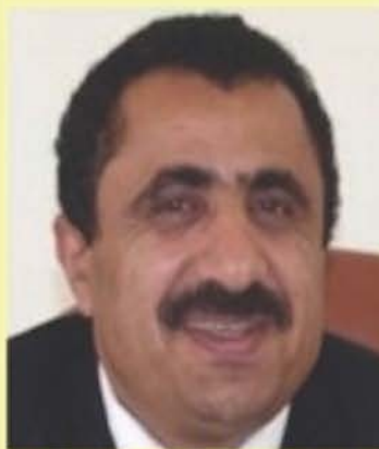
Ahmed Abdullah Dares Minister of Oil & Mineral Yemen