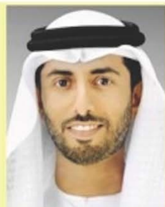
Suhail Mohammed Al Mazrouei Minister of Energy UAE