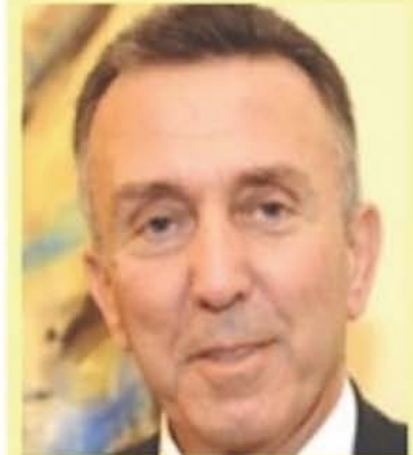
Jawad Naji Minister of National Economy Palestine