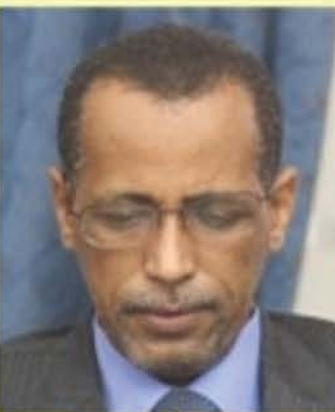
Mohamed Ould Khouna Minister of Petroleum and Energy & Mines Mauritania