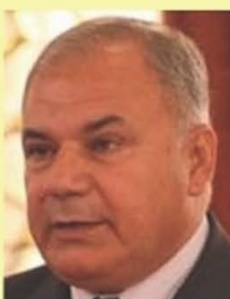
Mohammad Hamed Minister of Energy & Mineral Resources Jordan