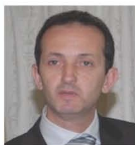
Anas Emran Scientific Institute Morocco