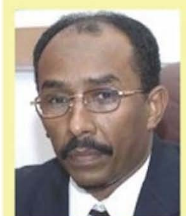
Ahmed Mohamed Sadeq El Karouri Minister of Minerals Sudan