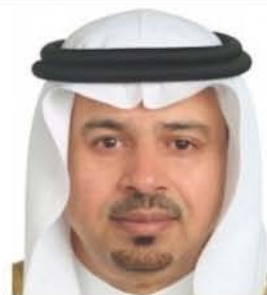
Sultan Bin Jamal Shawli Deputy Minister of Petroleum & Mineral Resources KSA